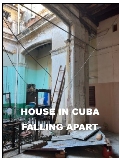
HOUSE IN CUBA FALLING APART

With your help, we were able to get this young family out of Cuba well over a year ago and their life has been more than improved. They were struggling like everyone else in that country and they decided to make a run for it when Cuba opened the door if anyone wanted to leave. Thank God everything has turned out well for this little family of five. The financial need is $3,000 for a decent used vehicle. Please pray!