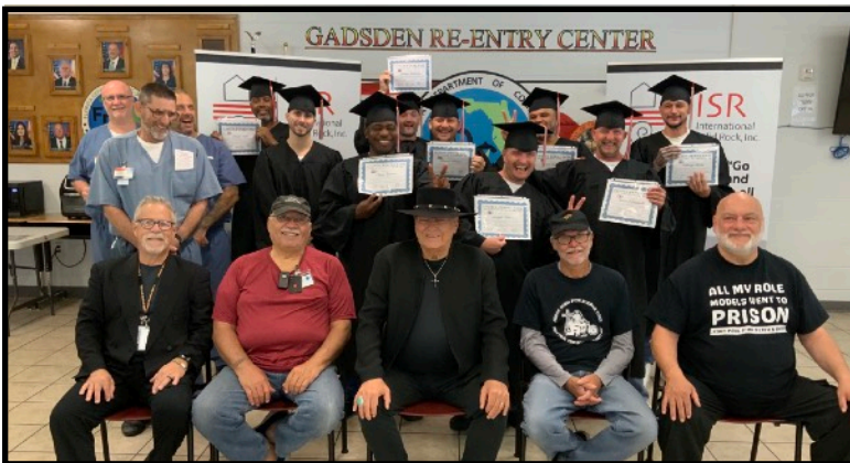
2025 CBB Graduating Class

Our ministry teams have just returned from a powerful 11-day trip in the panhandle of Florida including 4 prisons, two CBB graduations, 2 new CBB startups, 8 evening concerts, along with multiple teaching and training sessions by our VP Pastor Chip Nelson.