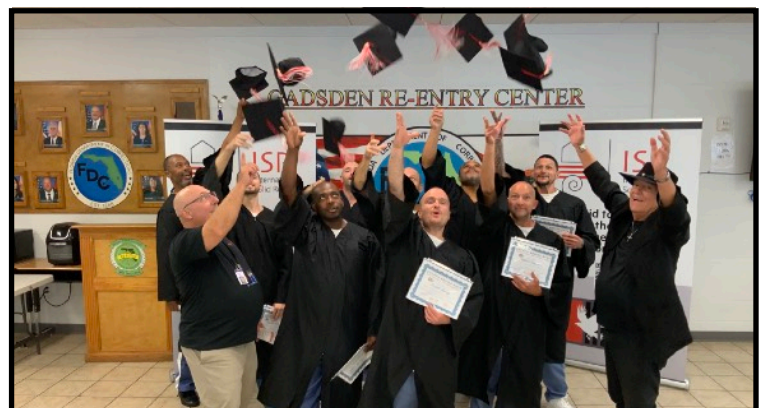
Congratulations Class of 2025